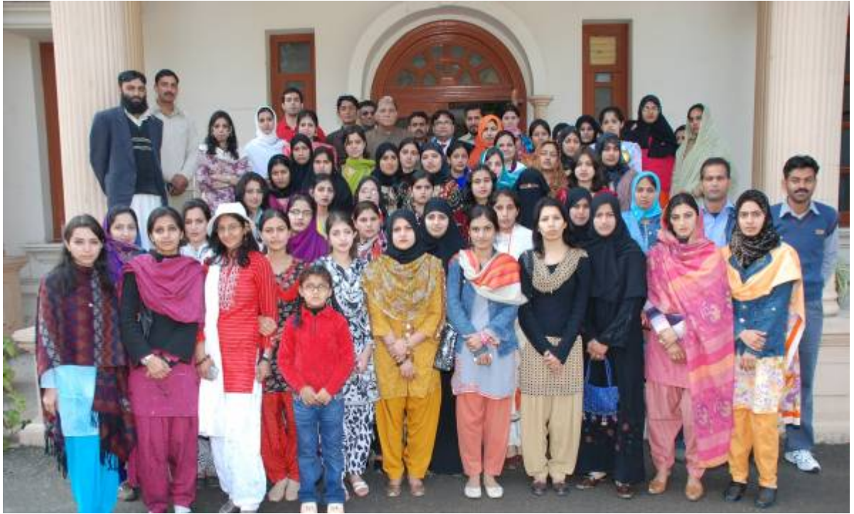
Members of the cultural preservation society on their visit to Nazarya Pakistan foundation