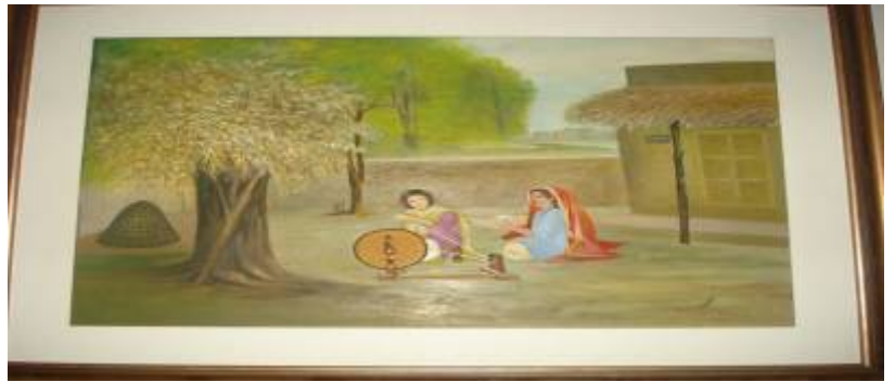
Different paintings and sketches in the exhibitions