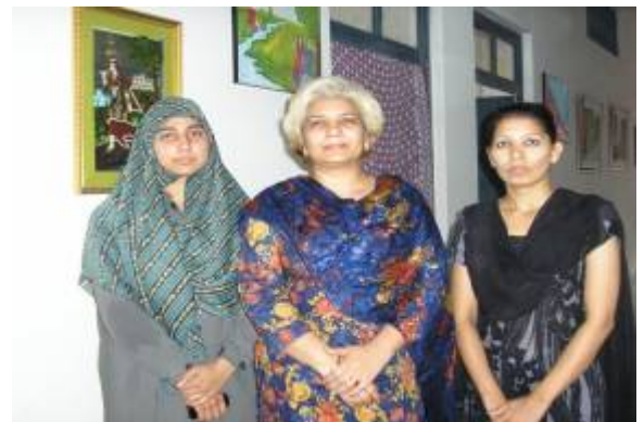
Visitors and faculty members watching paintings